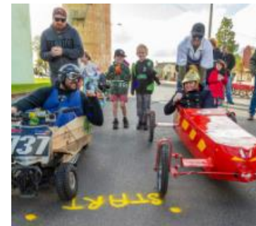
Billycart Derby 2019

The biggest drawcard at the 2019 Festival was the billy cart derby and it will be on the programme again to the delight of many kids and the bigger kids.