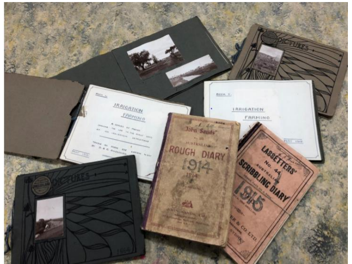
Anscombe Diaries & Photo Albums

This is the beauty of having appropriate facilities in our new premises where we can have confidence in storing this valuable information.