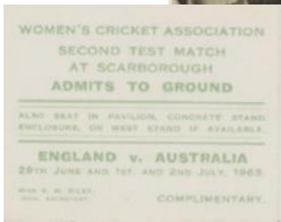
Copy of Ticket to 2nd test against England 1963