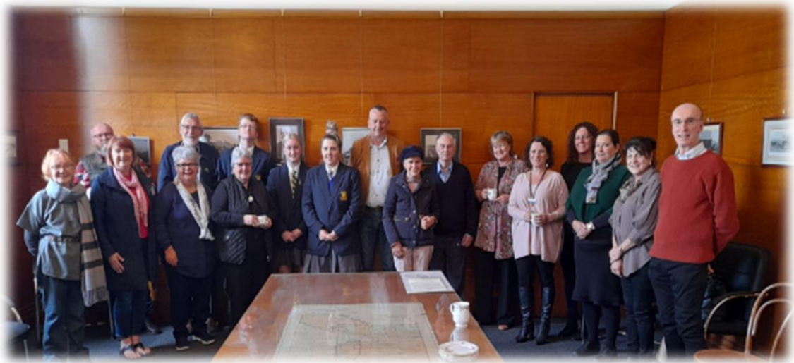
Members & Visitors at Our Presentation of Historic Map of McCaughey's North Yanco Holdings