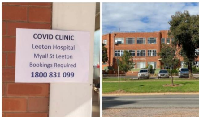
Residents with symptoms can be tested for Covid 19 in Leeton by booking an appointment at the Hospital. Bookings are essential.

Life has slowly been returning to normal, but there is still a long way to go before Covid 19 is confined to history.